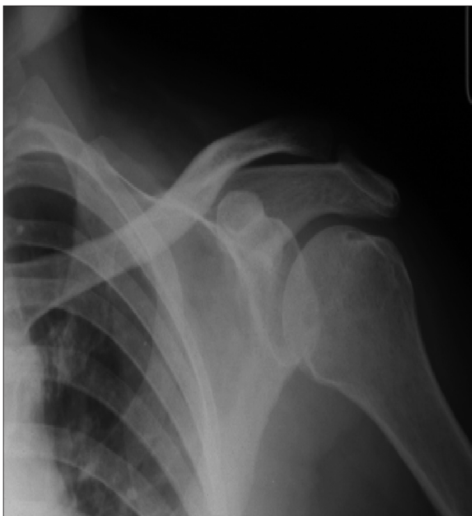
Figure 1. Radiograph of the left shoulder reveals subchondral cystic lesions in the humeral head.

Surgical intervention was planned and core decompression was carried out. The patient's shoulder pain relieved rapidly after surgery.