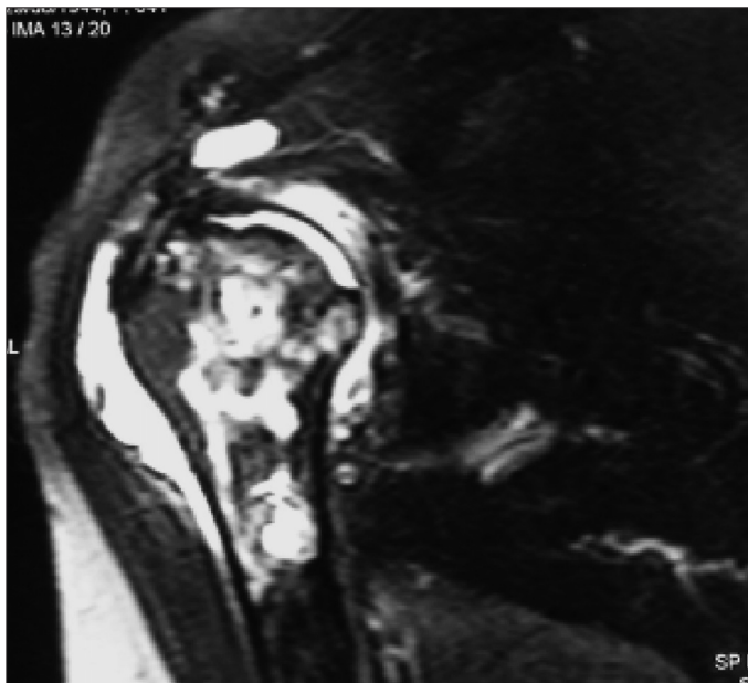
Figure 4. Coronal T2 weighted fat saturated image show severe osteonecrotic changes in the humeral head and increased signal abnormalities in the subdeltoid, subacromial and subscapular bursa.