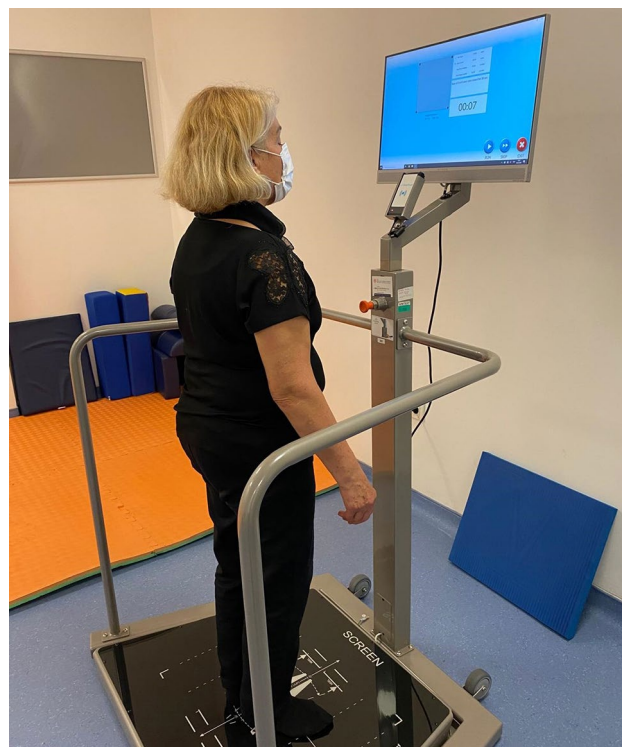
Figure 1. Patient positioning on the HUR SmartBalance device for static balance and proprioception testing.

The HUR SmartBalance device is used in both balance assessments and rehabilitative training programs, such as vertigo rehabilitation, balance training for mild gait disorders, and fall prevention in the elderly. [11] The device consists of a Balance Trainer, Support Rail, SmartBalance Software, Touchscreen Computer, and Foam surface (Figures 1, 2). Balance scores allow assessments