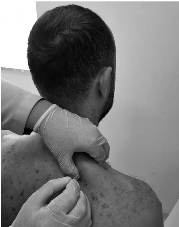
Figure 2. Dry needling technique of the trapezius muscle.

severe cardiopulmonary problems, pregnancy, or a history of neck/shoulder surgery. The study flowchart is shown in Figure 1. A written informed consent was obtained from each patient. The study protocol was approved by the Medicine Faculty of Atatürk University Ethics Committee (No. 2013-6). The study was conducted in accordance with the principles of the Declaration of Helsinki. [12]