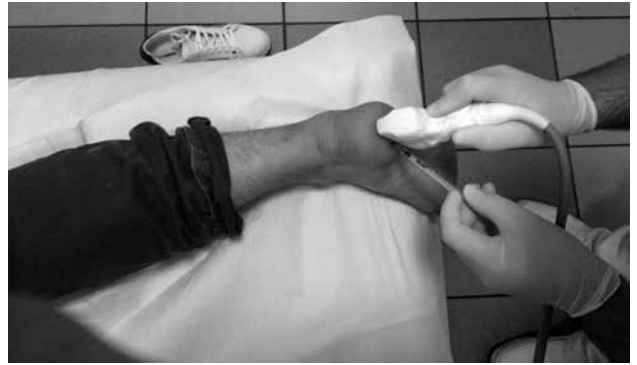
Figure 1. Ultrasound guided injection.

A total of 60 patients diagnosed with plantar fasciitis were included in the study between October 2014 and October 2015. All patients were randomly divided into two groups by computer (prolotherapy [n=29] and control [n=31] groups). Diagnosis was based on the identification of symptoms and physical examination findings. A lateral radiograph of the ankle was taken to exclude epin calcanei. Patients with tarsal tunnel syndrome and epin calcanei were excluded from the study.