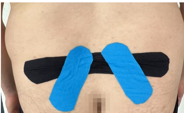
Figure 1. Ligament correction technique.

The required sample size was determined using G*Power version 3.1.9.7 software (Heinrich-Heine-