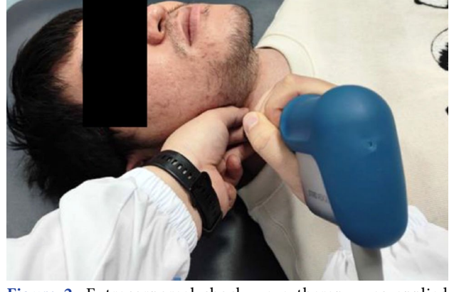
Figure 2. Extracorporeal shock wave therapy was applied to an active trigger point of the right sternocleidomastoid muscle in cervicogenic headache.

A portable algometer (SY-JL100A; Jiangsu Suyun Medical Materials Co., Ltd., Lianyungang, China) was used to measure the pressure pain threshold (PPT) on the trigger points of the SCM. An amount of pressure was applied to the MTP by placing the pressure algometer vertically on the patient's skin surface with the patient in the supine position. The pressure was stopped once the patient began to feel pain, and the degree of pain at that moment was