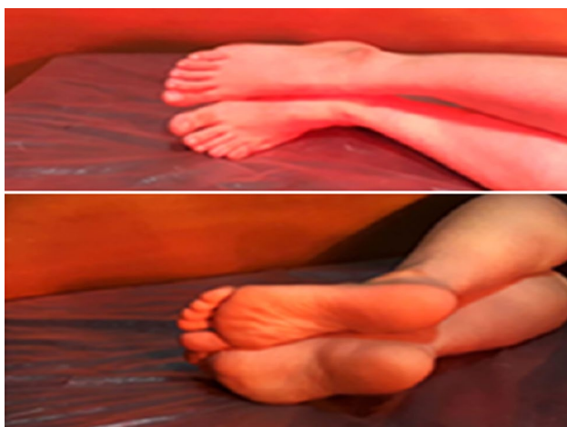
Figure 1. Method of applying infrared radiation on the surfaces of feet.

Nerve conduction velocity is a valuable method for assessing the severity of diabetic peripheral neuropathy. Considering the relationship between increasing the thickness of the basement membrane in the endothelial layer vessels and decreasing the thickness of myelin fibers, [24] TNCV was assessed at all stages of the study. The present study evaluated intratester reliability for the assessor using electroneuromyography in 10 patients with type 2 diabetes. Measurement of TNCV was performed by one assessor twice a day with an interval of 30 min by disconnecting and reconnecting the electrodes on the skin at baseline and after 10 sessions to calculate the correlation coefficient of TNCV. It was assessed