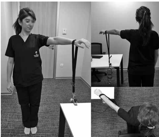
Figure 1. The participants were barefoot, both ankles touching each other. The measurements were performed in standing position with the arm in 90° of abduction in the scapular plane, the elbow extended and the forearm pronated.

All measurements were performed by the same two physicians in a standardized protocol. The standardized test position was standing with the arm in 90° of abduction in the scapular plane, the elbow extended and the forearm pronated (Figure 1). Volunteers were barefoot on a hard surface, both ankles touching each other during the test. Pushing maximally upward for five-sec, three times consecutively with one-min intervals for each shoulder side were instructed. The timings of the pushing, relaxation periods and activation of core muscles were provided by a visual timer placed in front of the participants. A loud verbal encouragement (ready 5-4-3-2-1, push, push, push) was also given throughout the measurements. Within each test series of three repetitions, the participants were instructed to rest their arm at the side between