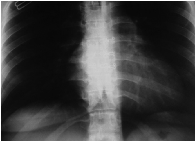
Figure 2. Increased cardiothoracic ratio, AP view. AP: antero-posterior

44 mm/h (0–20 mm/h) and 54.7 mg/L (0–3 mg/L), respectively. With this treatment, the patient's symptoms improved; ESR level decreased to 18 mm/h, CRP level decreased to 9.31 mg/L, and BASDAI score decreased to 2.