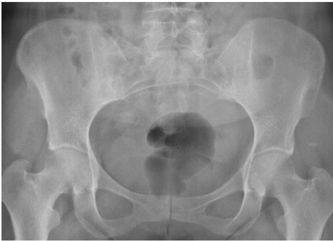
Figure 1. Bilateral sacroiliitis