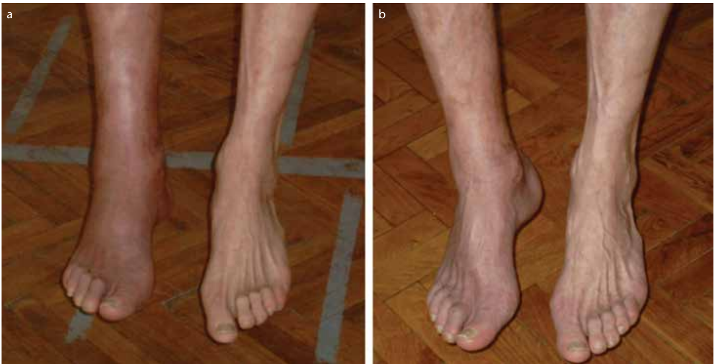
Figure 2. a,b. A 54-year-old man with complex regional pain syndrome type I in the right foot (a) before treatment; (b) after treatment