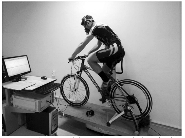
Figure 2. Placement of the system on a platform fixed to whole body vibration equipment.