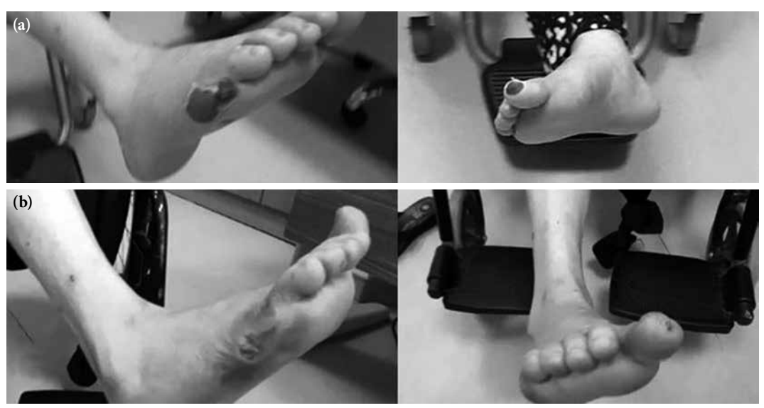
Figure 1. An image showing the necrotic wound (a) before and (b) after spinal cord stimulation treatment.

were present for six months (Figure 1a). She was treated with regular skin cleanings, dressing with antiseptics and topical antibiotics. The Fontaine stage was IV (rest pain and arterial ulcers) and the Ankle Brachial Index (ABI) was 0.60 on Doppler ultrasonography. Severe motor and sensory axonal neuropathy was observed on electroneuromyography. The right posterior tibial artery was totally occluded with distal reconstruction via collaterals to the ankle level according to angiography. Catheter embolectomy and balloon angioplasty were performed for limb ischemia. Recanalization was not achieved at the end of the angioplasty.