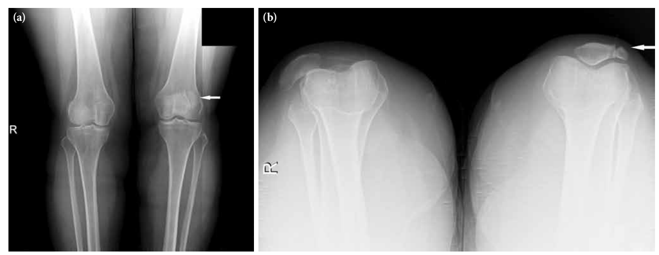
Figure 1. (a) Anteroposterior knee and (b) skyline patella view of both knees radiograph.

way of cutaneous mechanoreceptors.<sup>[5]</sup> We hereby present the effectiveness of the KT treatment that has been applied to the female patient suffering from symptomatic unilateral bipartite patella.