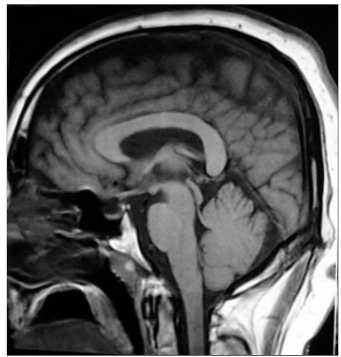
Figure 1. Sagittal T1-weighted image demonstrating atrophy in the cerebellar vermis.

Neuromuscular examination revealed motor deficits. Shoulder and elbow 4/5, wrist 3/5, flexion of fingers 3/5, extension of fingers 2/5, and abduction and adduction of fingers were 1/5 in his left arm. No motor deficit was detected in the other three extremities. Tendon reflexes of the upper extremities were brisker on the left side than on the right. In the lower extremities, bilateral patella reflexes were absent and Achilles reflexes were normal. Plantar response was extensor in the left lower limb. Severe sensory impairment (touch and pinprick) of the left upper extremity, such as hypoesthesia in C6 and T1, anesthesia in C7, and C8 dermatomes, was observed. In the other three extremities, sensory examination was normal. In all extremities proprioceptive sensory joint movement and position was unaffected. Atrophy of the thenar and hypothenar eminence muscles was noted. At the cerebellar system examination, horizontal nystagmus was positive. There was no asymmetry in pupillary size, but both pupils were unresponsive to light. Moreover, bilateral loss of