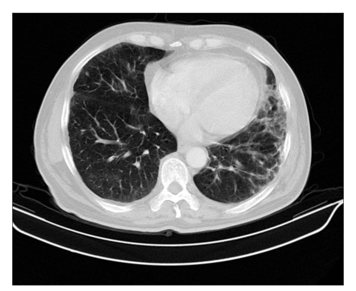
Figure 1. Peripheral predominant reticular abnormality with raction bronchiectasis and honeycombing. Also the vascularization of the lung is prominent with fissuritis on the right side. The pericardial fluid is a bit increased but with in normal limits.

Primary pulmonary amyloidosis (PPA) is a rare disease of plasma cell origin, composes 1.1% of all amyloidosis cases (10). Localized type of amyloidosis in the lung can be seen in two forms: limited