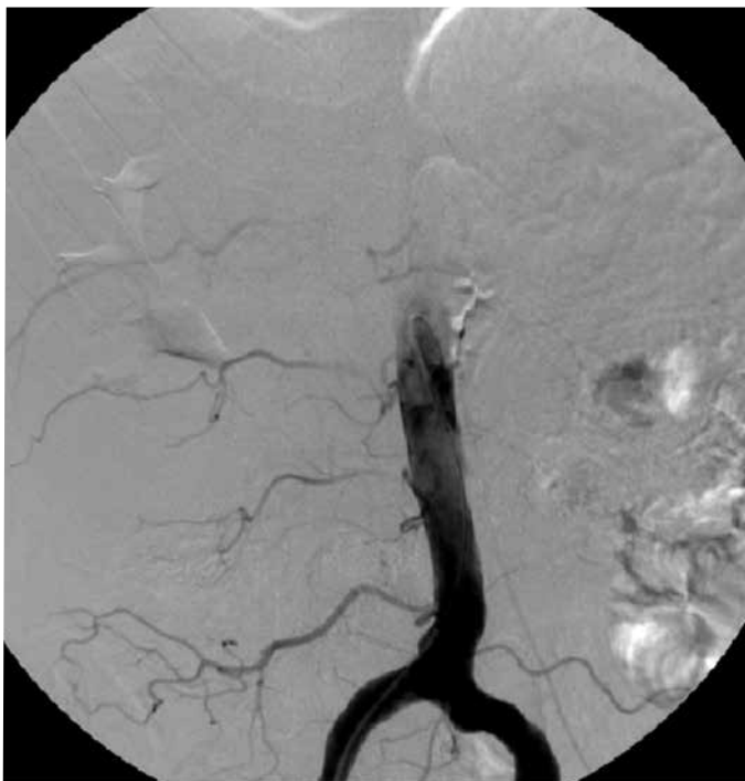
Figure 2. A conventional mesentery artery angiography showed an occlusion in the inferior mesentery artery.

surgery and was operated. The surgeon confirmed the large bowel perforation and performed left hemicolectomy with colostomia. Pathological examination of the resected bowel segment was as follows: diffuse mucosal hemorrhagic infarct, presence of multifocal ulceration, transmural hyperemia and edema, fibrinoid necrosis in the vessel walls, and perforation of the colon wall. After all these findings, the patient was diagnosed as having PAN, and corticosteroid (1 mg/kg/day) and cyclophosphamide 1 g/month was introduced immediately.