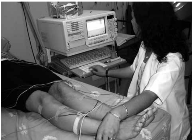
Figure 1. Electrode setup and electro-neuro myelography device.

applied to each participant up to their tolerance limits. Upper limit of the current intensity was accepted as 50 mA, which is the admissible security limit of the ENMG device. Stimuli were applied in an irregular time pattern (5 to 30 sec) to avoid habitual effect. The procedure was discontinued, when a VAS value of 10 was reached.