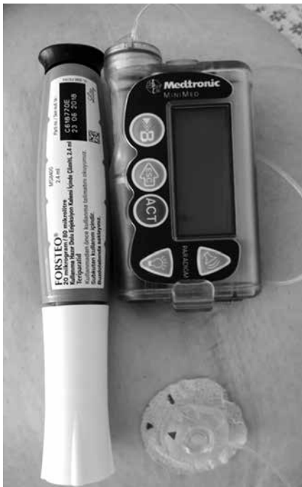
Figure 1. Teriparatide through an insulin pump.

teriparatide was also shown to be safe and effective. Moreover, it was observed that, compared to single-dose subcutaneous teriparatide injection, continuous infusion of teriparatide via an insulin pump was more effective. [8] In another study, Puig-Domingo et al. [9] succeeded to treat the treatment-resistant hypoparathyroidism through PTH in short-interval pulse-type to mimic physiological PTH release.