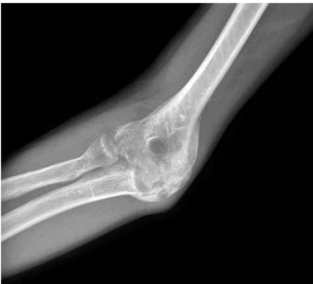
Figure 3. The X-ray image of the patient's right elbow.

The patient underwent range of motion exercises, gentle stretching, and occupational therapy in our