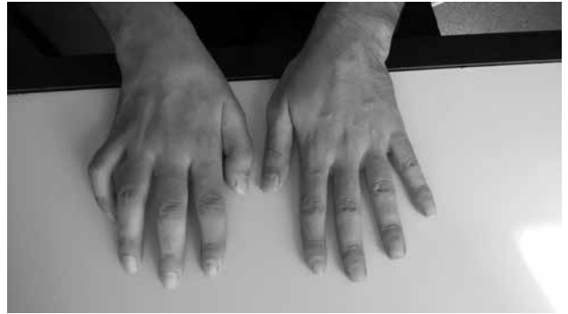
Figure 2. The position of the patient's hand.

(DUC) nerves of right hand and electromyography (EMG) of the abductor digiti minimi (ADM), flexor carpi ulnaris (FCU), flexor digitorum profundus (FDP), abductor pollicis brevis (APB), extensor indicis proprius (EIP), cervical 8 (C8) and thoracal 1 (T1) paraspinal muscles were performed to exclude lower brachial plexopathy or C8-T1 radiculopathy.