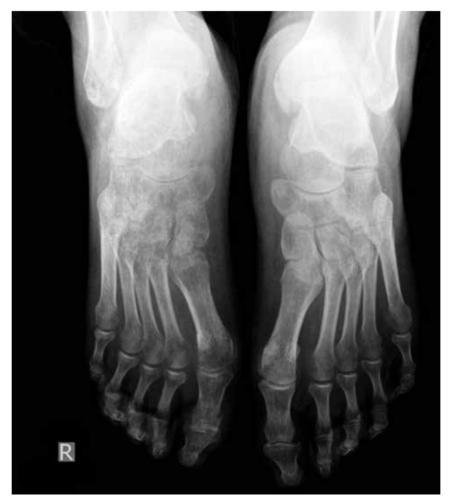
Figure 1. Right lower extremity of the patient.

which was operated. The pseudoaneurysm capsule was opened and hematoma was drained via popliteal fossa. Then, the popliteal artery was clamped and a vena saphena magna graft was used. A vacuum-assisted closure device was applied to the popliteal area in the postoperative period due to inflammatory fluid collection in the popliteal fossa. Protective fasciotomy was also performed. The patient was admitted to the cardiovascular intensive care unit, and five days later she was transferred to the ward. The patient developed peroneal nerve damage due to multiple operations which caused weakness in the right foot, ankle, and difficulty in walking. She was, then, referred to our clinic for rehabilitation. When the patient was admitted to our inpatient clinic, she had steppage gait with hyperflexion of the hip and knee joints. The patient also used bilateral crutches. There were scar tissues and suture remained on the anterior face of right thigh, right calf, and medial side of right ankle (Figure 1). During motor examination, the left lower extremity muscle strength was globally 5/5, while the right lower extremity muscle strength was as follows: musculus tibialis anterior 1/5, musculus extensor hallucis longus 1/5, and other muscle groups 5/5. The right ankle range of motion was limited and it had a fixed position of plantar flexion/equinus. During sensory examination, global hyperesthesia was detected in the right leg. The patient complained of pain in the right hip since